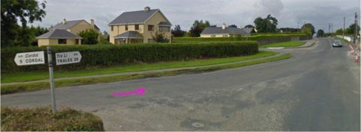
Approx 2.3 miles...A hill in the last mile. Several hundred metres long...sharp at first but then eases off