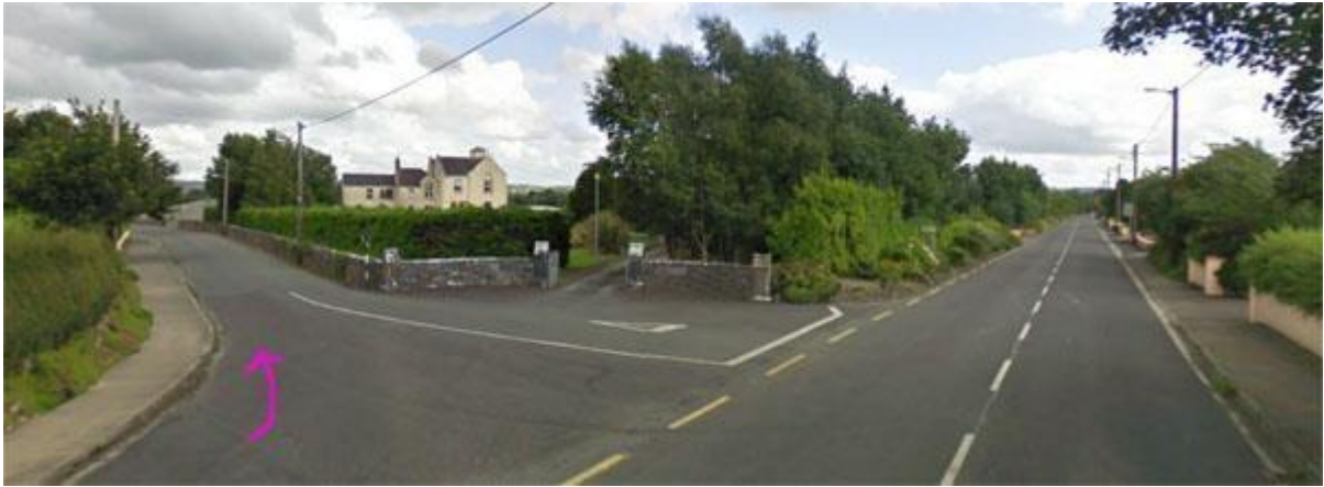
Approx 0.7 miles...Turn left onto a quieter country road