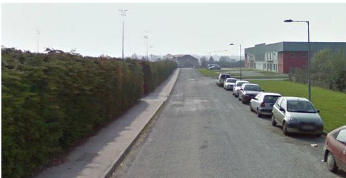
Flat fast run into the finish