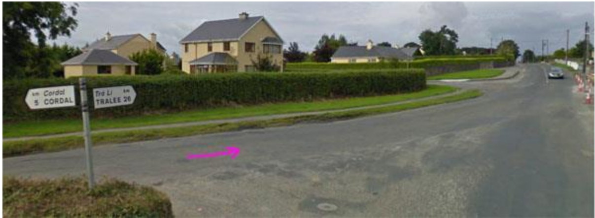
Approx 2.3 miles...A hill in the last mile. Several hundred metres long...sharp at first but then eases off