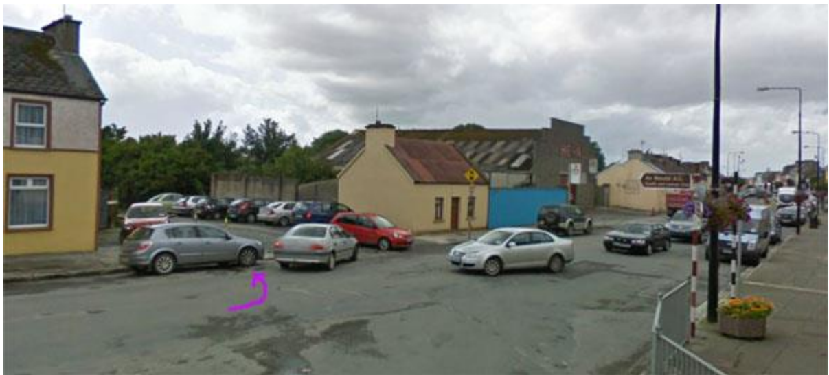
Approx 3.0 miles...Turn left and head down the narrow road towards the sports track