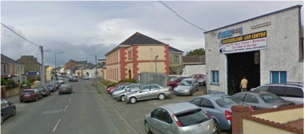
The start line outside O'Donoghues Garage