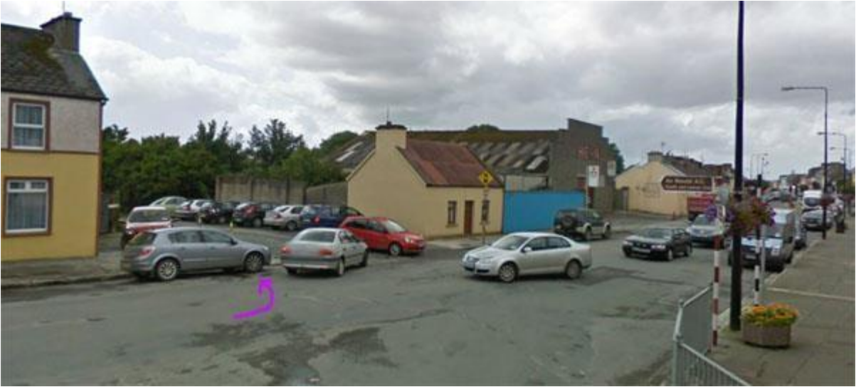
Approx 3.0 miles....Turn left and head down the narrow road towards the sports track