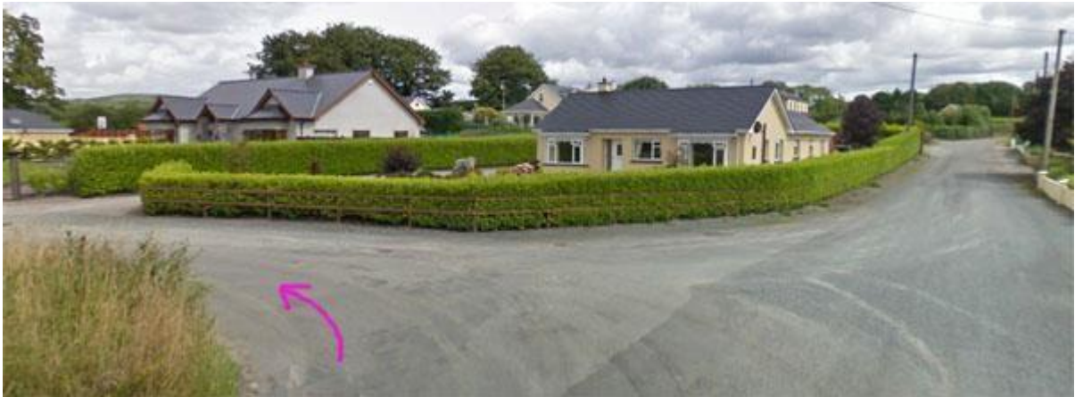
Approx 1.3 miles.....Turn left and head back in towards the town