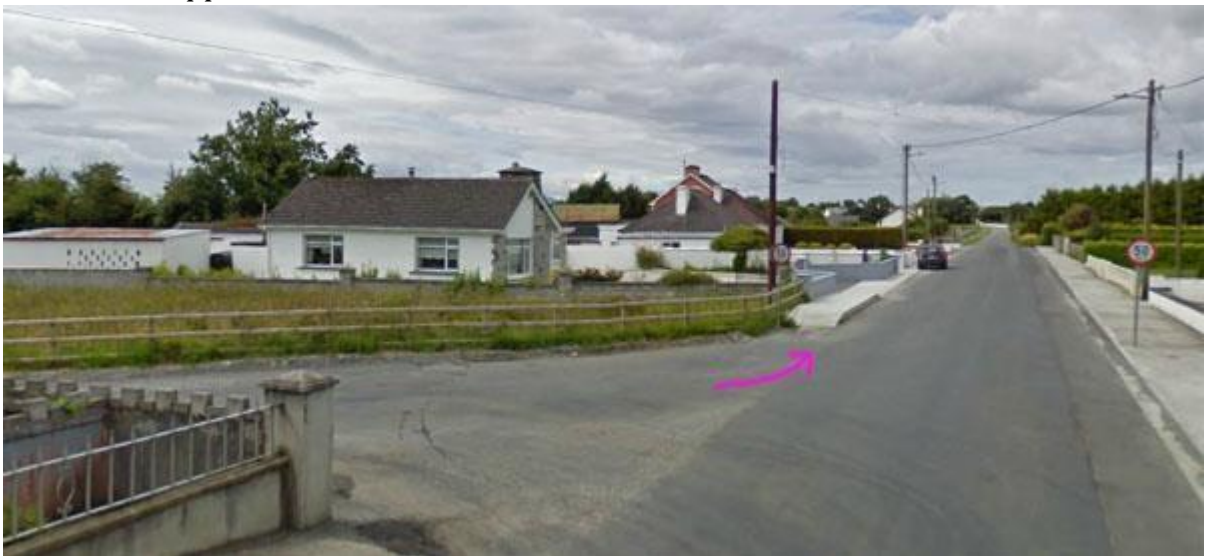
Approx 2.0 miles.....Back into the outskirts of the town